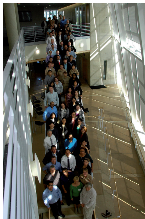
PIC/S QRM Advanced Training, hosted by US FDA, Los Angeles (USA), October 2015