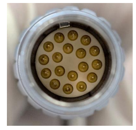
Figure 2: Motor Connector Pin View

Note: If there are any issues while connecting the CentriMag Motor to the CentriMag Console, inspect the Motor port on the rear of the Console for damage, particularly for any broken pins that may be lodged inside.