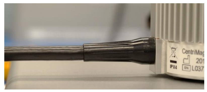
Figure 4: Cable Bend Relief at the Motor