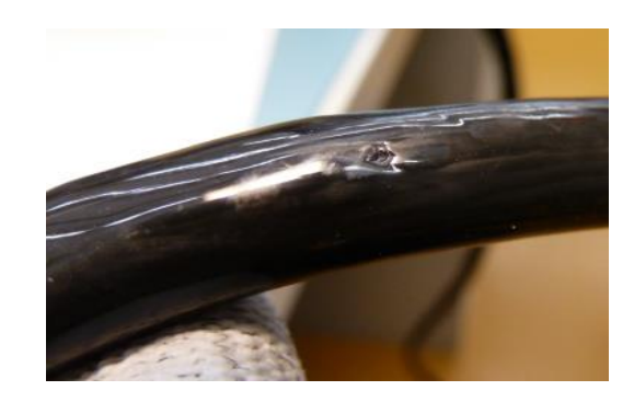
Figure 8: Damaged Motor Cable