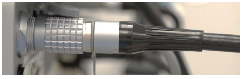
Figure 3: Cable Bend Relief at the Console Connector

2. Visually inspect the entire length of the CentriMag Motor cable, including both bend reliefs (see Figures 3 and 4), for any damage such as separations of the bend reliefs, deformations, kinks, or cuts. These types of damage indicate wear and tear or previous rough handling of the cable, which has the potential to result in internal wire damage. Cable thickness and shape should be uniform throughout the length of the cable.