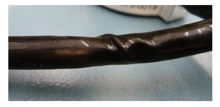
Figure 7: Damaged Motor Cable