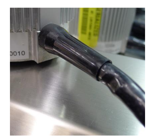
Figure 5: Cable Damage at the Motor Bend Relief