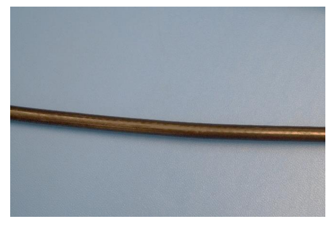
Figure 6: Undamaged and Intact Motor Cable