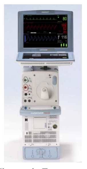
Figure 4: Cardiosave in Transport Configuration

An unexpected shutdown upon battery removal cannot occur for Cardiosave Rescue.