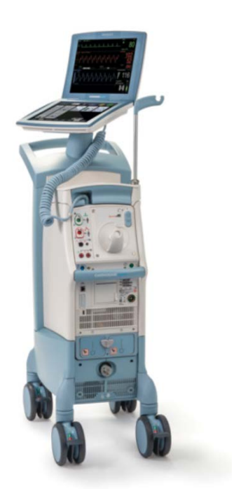
Figure 3: Cardiosave in Hybrid Configuration