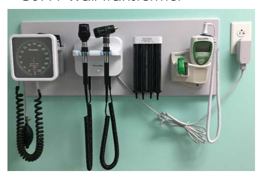
GS777 Wall Transformer