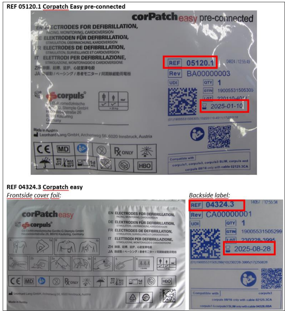
Figure 1 Identification of potentially affected product based on REF and expiry date on the label by the means of 2025-10-13 or earlier (for sample see red frames, REF 05120.1 also represents REF 05120.3, both pre-connect in pouches, and REF 04324.3 in hardshell).