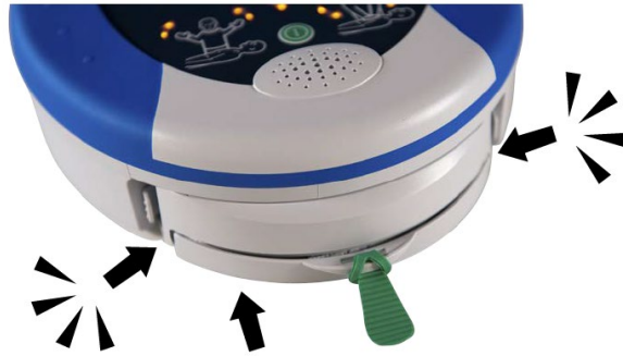
Figure 3 – Inserting a Pad-Pak