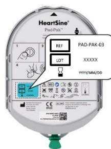
Figure 2 – Pad-Pak Expiry